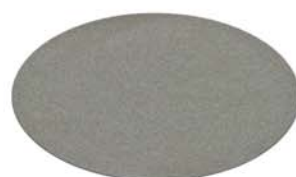
SUMMER SUEDE METALLIC