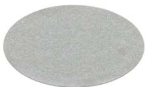
FAWN METALLIC LT201016XL