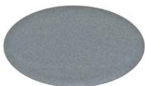
SILVER SHADOW LT201015XL