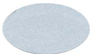
WHITE ICE METALLIC