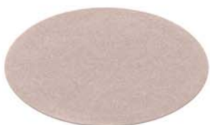
ICED CAPPUCCINO LT201032XL