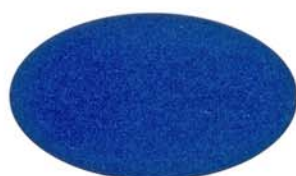
MIDNIGHT BLUE ICE

UC Code = extrusion code number 3ZM/4ZM Code = coil code number