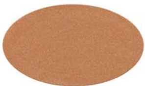
CINNAGOLD DUST LT201035XL