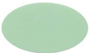
SILVER SAGE METALLIC LT201034XL