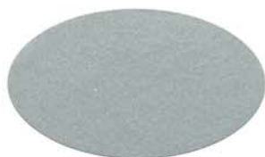
SILVER GRAY Classic LT120037XL