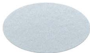
SILVER Classic LT704-70