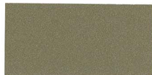
LT200079XL Medium Bronze #312