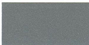
LT200032XL Medium Gray