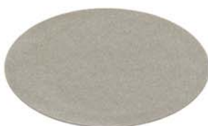
AUTUMNWOOD METALLIC LT201019XLBBC