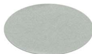
CHAMPAGNE GOLD Classic LT200012XL