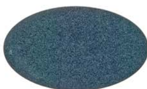
GRAPHITE GRAY LT201017XLBBC