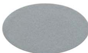
PEWTER Classic LT200007XL