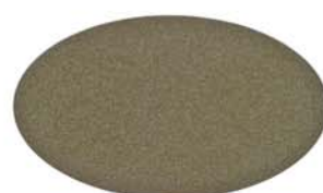
CHOCOLATE BRONZE LT201018XL