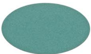
SEA MIST GREEN LT201033XL