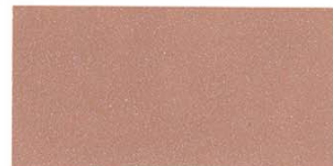
LT200006XL Metallic Redwood