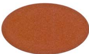
COPPER CANYON LT201037XL