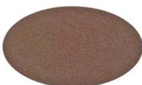
VINTAGE BRONZE LT201030XL