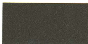
LT200038XL Dark Bronze #313