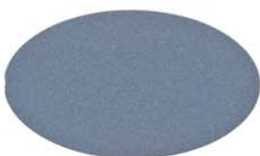
OXFORD BLUE METALLIC LT201036XL