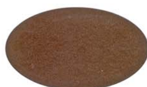
MINERAL BROWN METALLIC LT201029XL