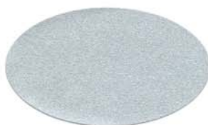
STEEL-CITY SILVER LT201022XL