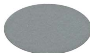
MEDIUM GRAY Classic LT200032XL