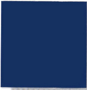
Regal Blue LTV105